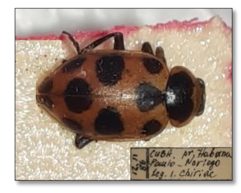
Figure 2. Coleomegilla maculata.

The collection also includes specimens of Harmonia axyridis collected in North Korea and Russia, but which are now widely distributed in all types of habitats in the Republic of Moldova, becoming an invasive species.